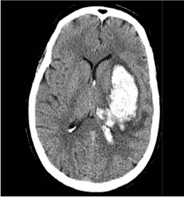
Computed tomography of an intracranial haematoma